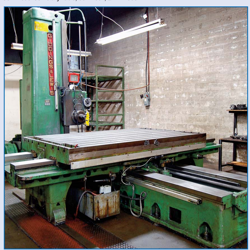
G&L 340T HORIZONTAL BORING MILL

G&L Model 60 Rotary Table, 60" x 60", s/n A-4803