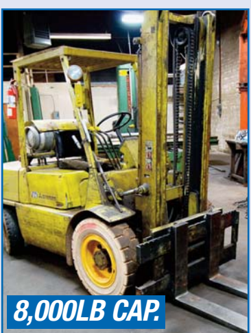
MITSUBISHI FC35A PROPANE FORKLIFT