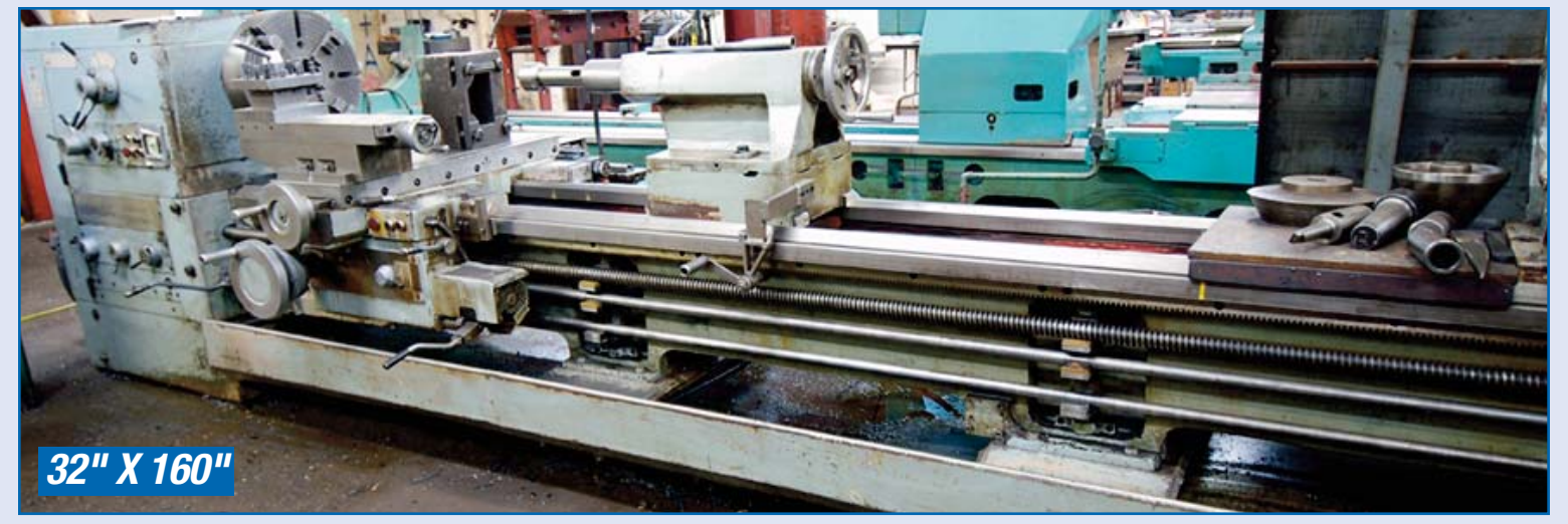
TITAN SNA 800X4000 ENGINE LATHE