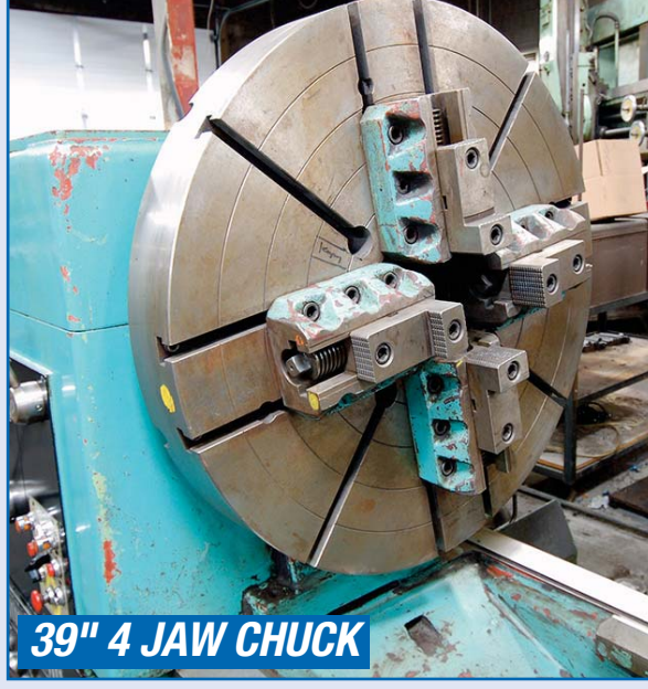
TOS SU 125 Engine Lathe, 314.96" Between Centers, 50" Swing, 37" Swing Over Cross Slide, 39" 4 Jaw Chuck, 4-1/8" Bore, 1.8-355 RPM, Weight of Work Piece 11,000lbs Cap. (13,300lbs Cap. Supported By Rest), Powered Tailstock w/ Pressure Gauge, (2) Steady Rests, Follow Rest, Large Asst. Tooling, 35HP, s/n 0443218