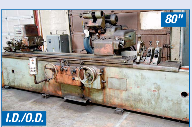
TOS B400 2000 CYLINDRICAL GRINDER