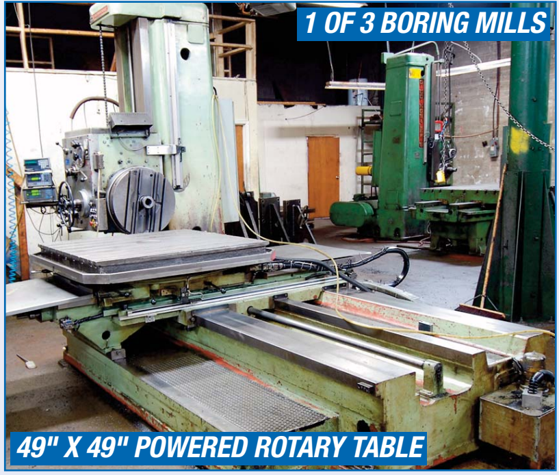
TOS W100A HORIZONTAL BORING MILL