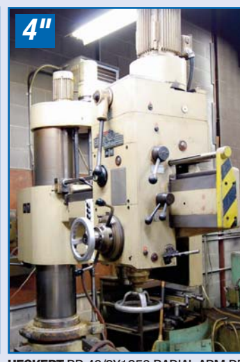
HECKERT BR 40/2X1250 RADIAL ARM DRILL