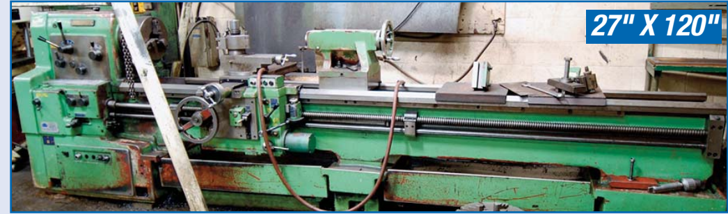
HWACHEON (DARBERT) WL-630 ENGINE LATHE