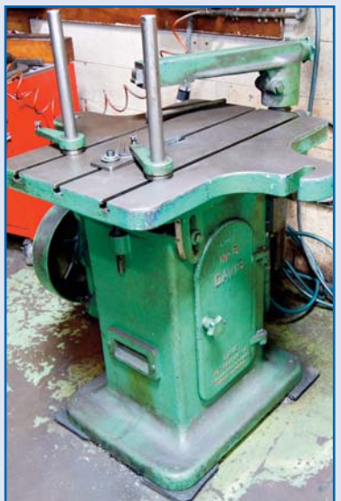
DAVIS NO. 5 KEYSEATER