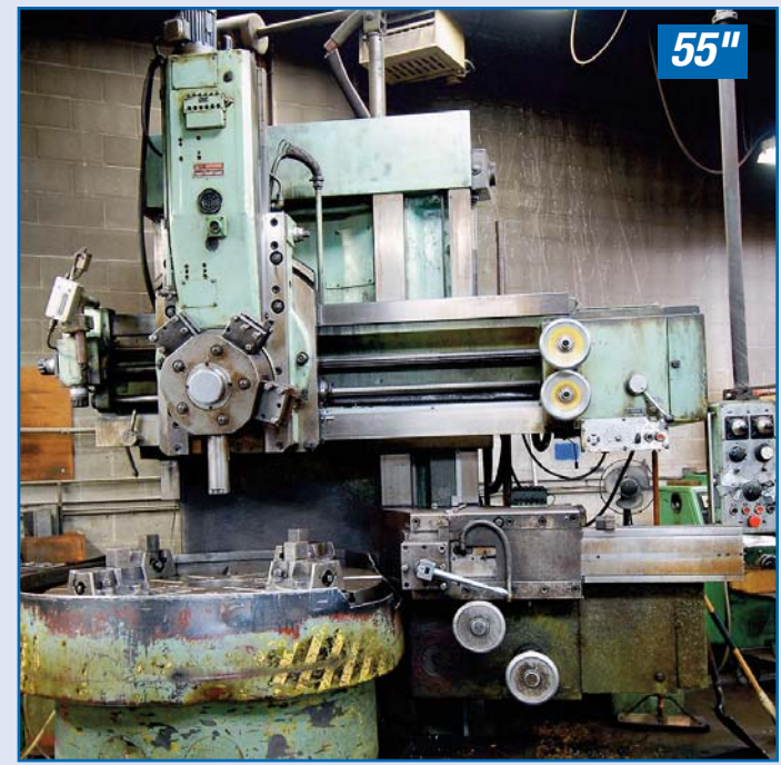
STANKO 1516 VERTICAL BORING MILL