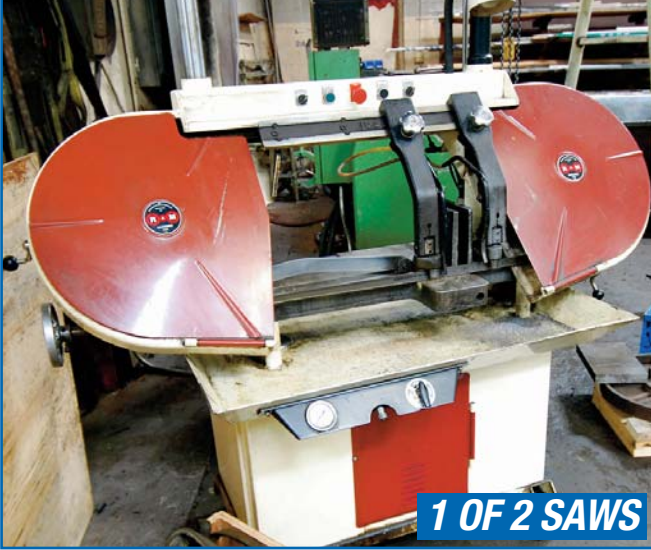
RAM H-FRAME HORIZONTAL BANDSAW