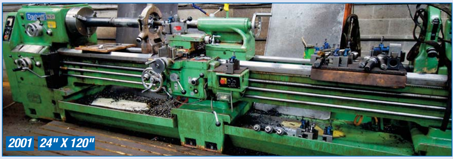
DARBERT PA-24 ENGINE LATHE